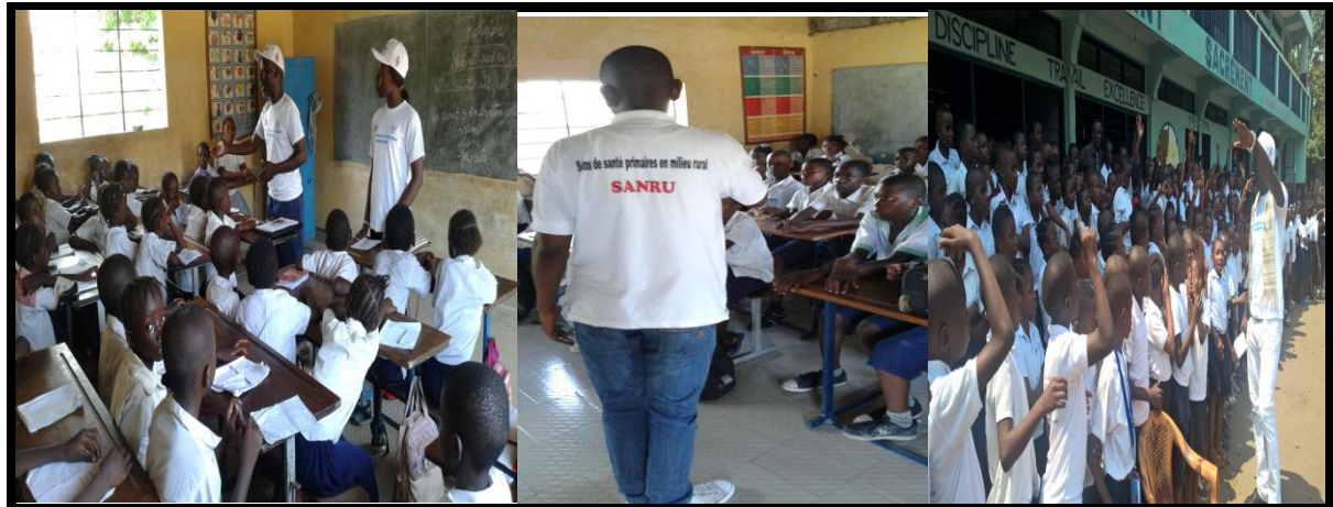
During awareness-raising at the GYAVIRA school by civil society actors

This is a field activity that targeted 54,000 pupils. A working session to harmonize the agenda of this activity was organized with school principals. The day of the beginning of this sensitization was fixed by consensus. Ambiance during sensitization on malaria transmission, prevention and treatment was very good. Particular emphasis was placed on the correct use of the LLIN.