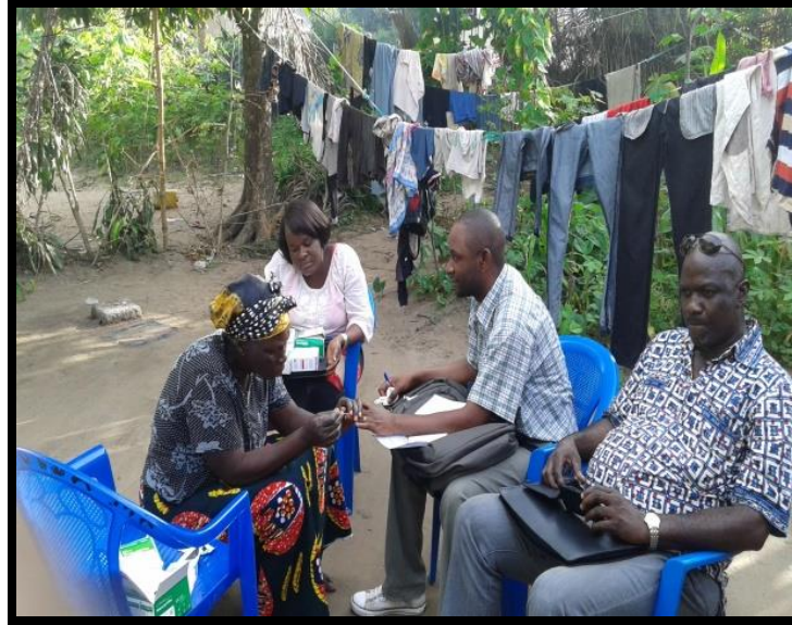
Raising community awareness prior LLINs Mass Distribution Campaign The recosite does RDT in the SSC